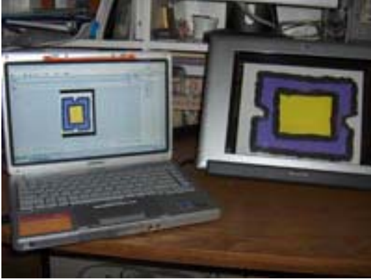
Ticket painting by Mac, 7, Bayview School, Vancouver

1. Scan in the picture that you want to use